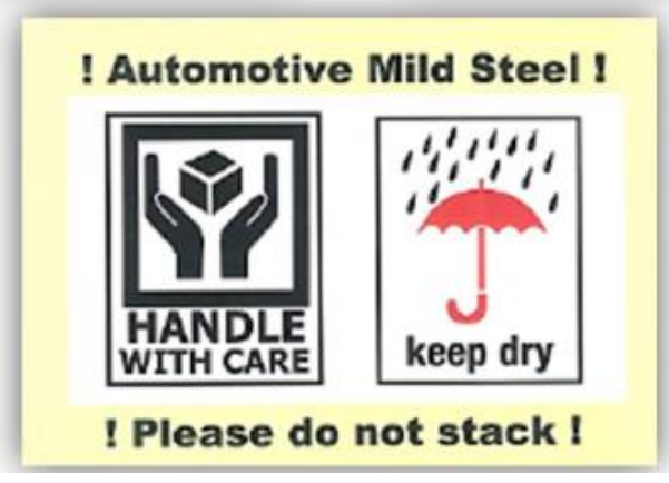
Figure 3: Coil labels that prohibit stacking

Loading, unloading and stowage are permitted only under dry weather conditions. Work activities must be discontinued during rainy or snowy conditions, and the ship hatches must be closed immediately. Any coils on the quay must be protected from wetness, e.g. by covering them with tarpaulins.