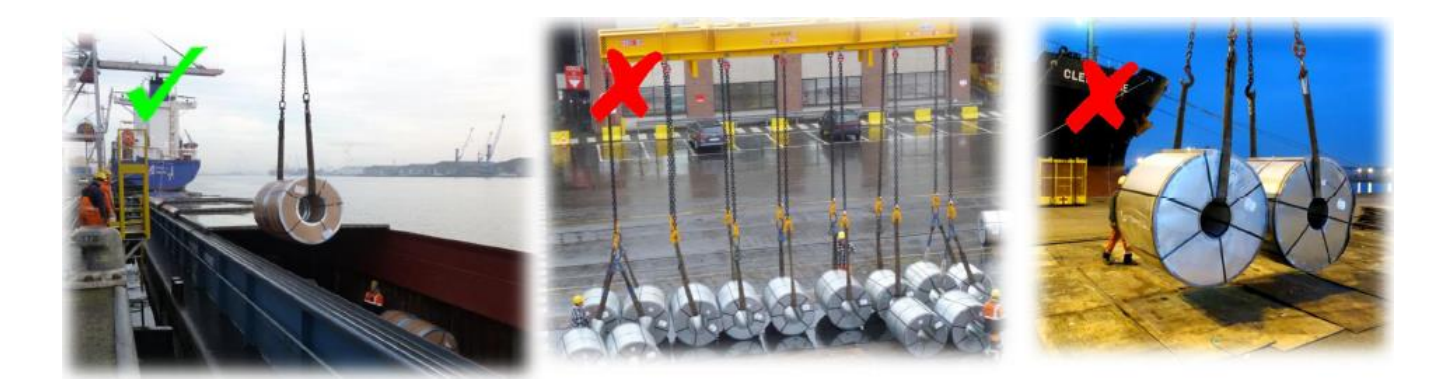
Figure 4: Quay loading and unloading

Coils produced by voestalpine must be individually loaded, unloaded and transported. Hoisting more than one coil simultaneously with any equipment is strictly prohibited.