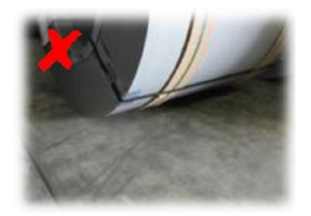
Figure 1: Optimum storage of coils on the warehouse floor