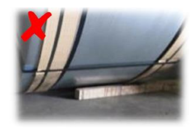
Figure 2: Securing of coils during interim storage